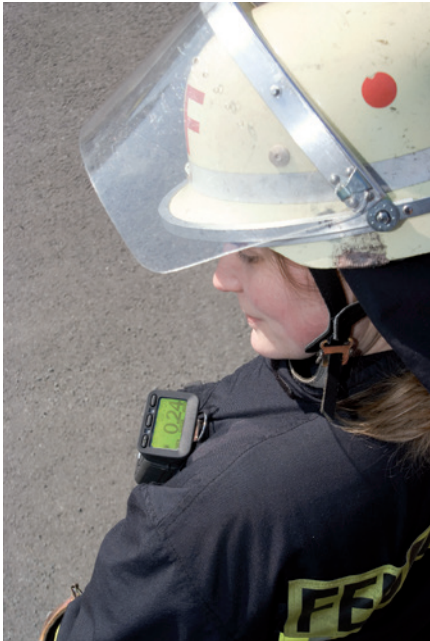
Reversible display always visible